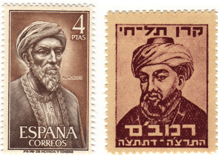
Figure 2: My favorite stamp

I will start off the series with my own experience in the April issue.