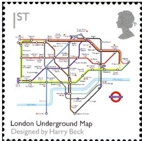
Figure 1: Street Cars

Follow links on the webpage for information about other local clubs, shows, and maps to the shows.